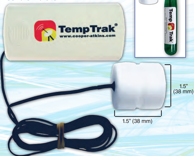
#10113 Solid Simulator